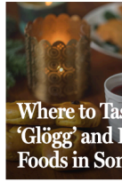
Where to Taste 'Glögg' and Other Foods in Sonoma

BITECLUB, THINGS TO DO IN SONOMA, WHAT'S NEW IN WINE COUNTRY