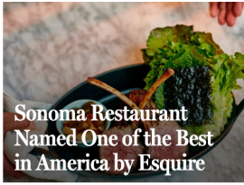
Sonoma Restaurant Named One of the Best in America by Esquire