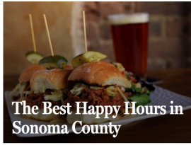
The Best Happy Hours in Sonoma County