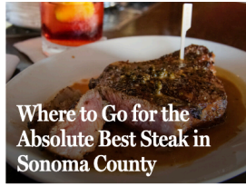
Where to Go for the Absolute Best Steak in Sonoma County